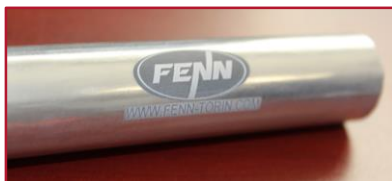
Example of a laser engraved, reduced tube produced on a turn-key system from FENN