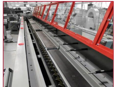
Manual Chain Type Drawbench