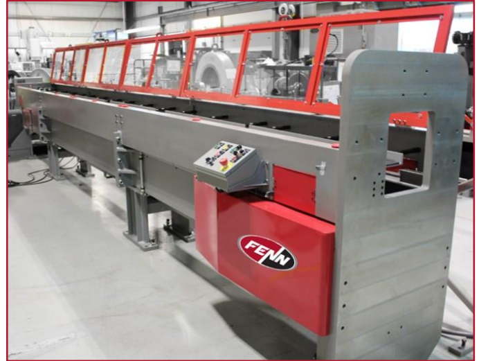
Manual chain type drawbench

Systems up to 230 ft. long (70.1 m.) with 200,000 lb. (90,718.474 kg.) pull.