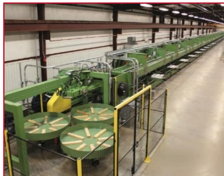
Fully Automated Chain Type Drawbench