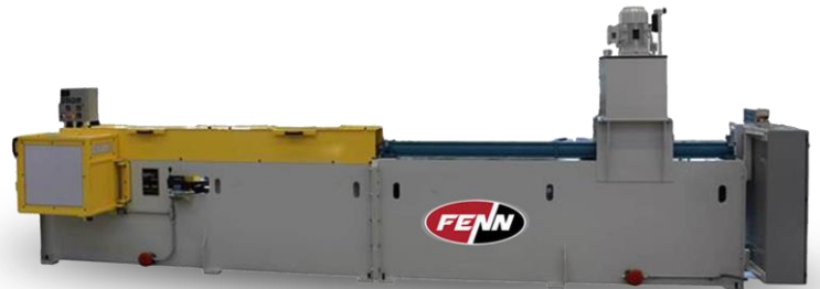
Hydraulic drawbench with auxiliary draw block