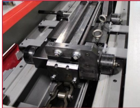
Chain Type Drawbench