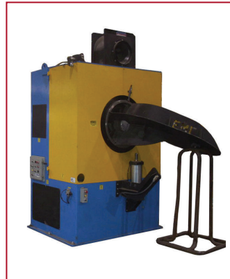
Dead Block Takeup Unit

Packaging Turntable — To convert normally unruly stands of wire coils (random fall) into high density packages (pattern laid). For use with Dead Block machinery.