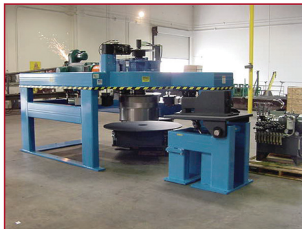
Inverted Bull Block with Pit