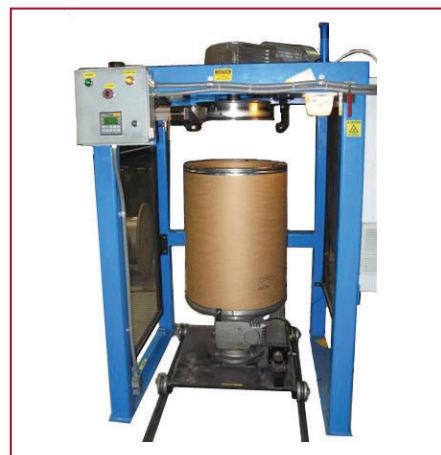
Barrel Pack Inverted Bull Block