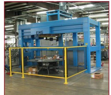
Inverted Bull Block Above Floor