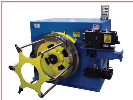
Side Winder Bull Block

Barrel Pack Bull Block — Paying out wire from a barrel