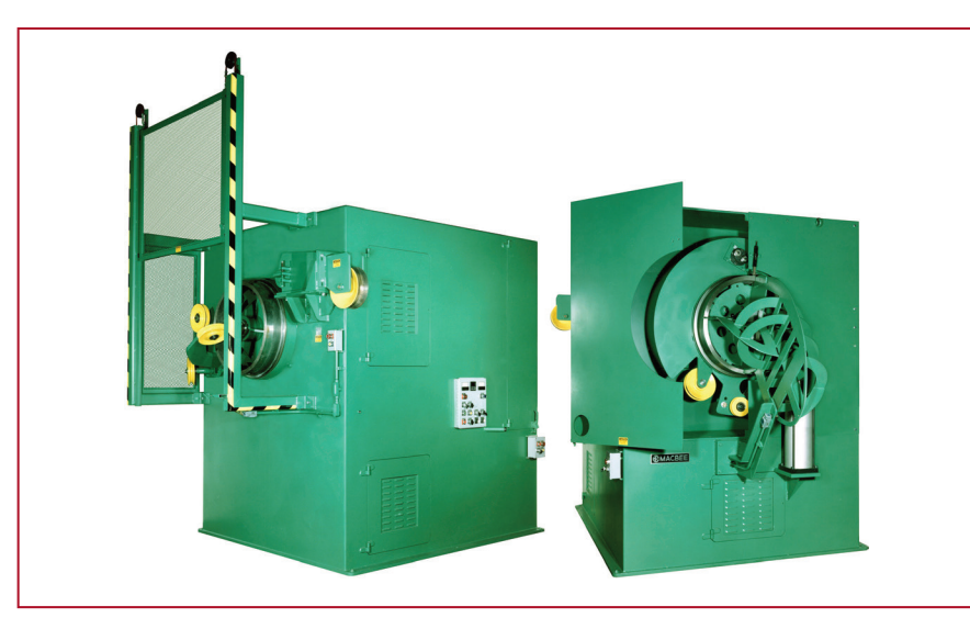
Double Draft Dead Block