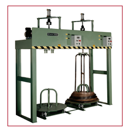
Live Block Takeup