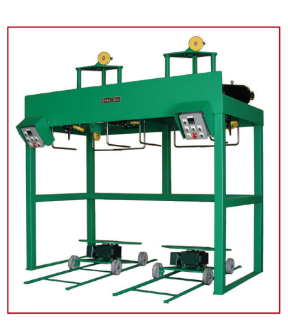
V-Groove Dead Block Takeup