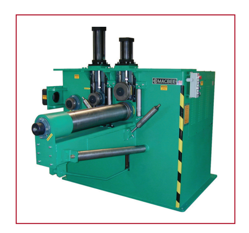
Horizontal Rod Payoff