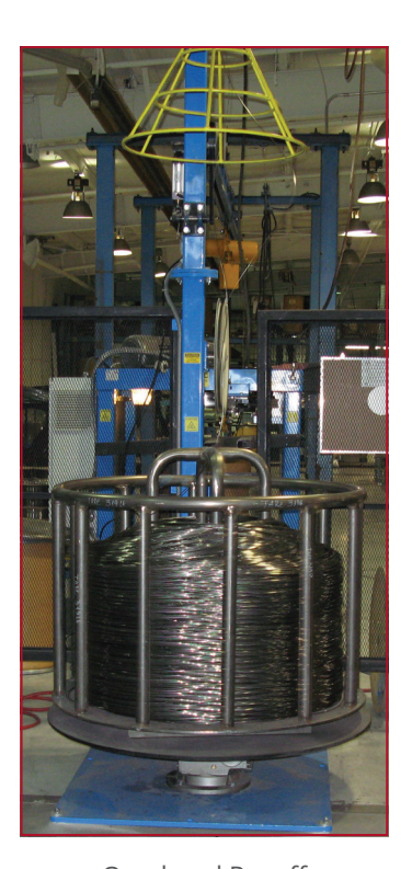
Overhead Payoff with Turntable