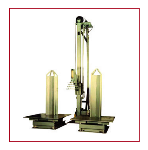
Overhead Payoff with Coil Upenders